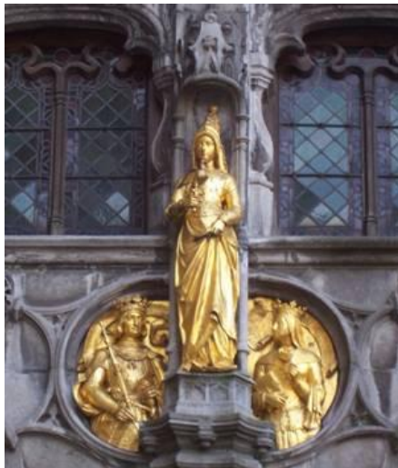
Statue of Queen Marie de Bourgogne in Bruges, Belgium holding her beloved falcon

This experience allowed me the opportunity to exchange knowledge about many of the environmental issues concerning birds of prey as well as training and conditioning. Many countries in Europe are still working toward implementing wildlife laws and regulations. They recognize the United States as leaders in setting precedence in protecting and preserving the environment. Wildlife rehabilitation is something very new in many parts of the world. We have many freedoms in the U.S. that most other countries envy. For example, there is no such thing as "public land" in Europe, every inch of land is owned by someone. I can't imagine having to rent a small space to fish along a river or lake, can you? In some countries like Holland you can only possess a captive bred peregrine or goshawk. No other raptors are legal to possess for education or falconry. They were amazed by the different species of birds I am allowed for my education programs. In some countries like Germany, it is still legal to shoot raptors. I was asked many questions about rehabilitation, since it is almost non-existent in many places. We are fortunate to have laws that protect our resources