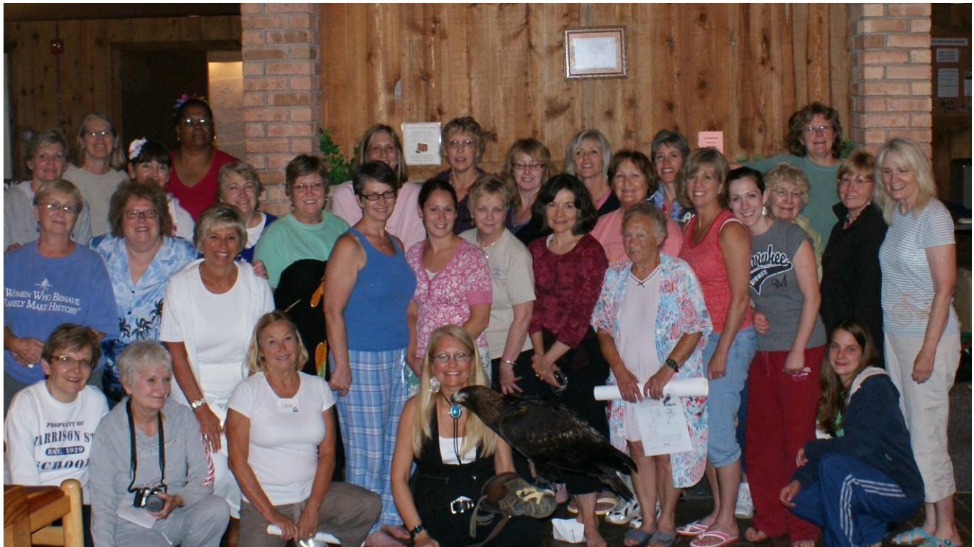
Women's Wellness Weekend, Camp Edwards, East Troy Wisconsin www.campedwards.org