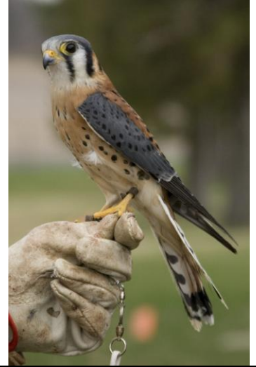
Male American kestrel falcon

Hoo's Woods Raptor Center cordially invites you to our annual open house. It is through your support and generosity we continue our work in raptor education and rehabilitation. We offer this unique opportunity for you to visit our facilities. You will meet our education birds including: "Wapaha" the golden eagle, "Winston" the peregrine falcon, "Hoodini" the barred owl and all the others. Tours will begin at 11:00 am. We will be releasing two American kestrel falcons at 1:30 pm (weather permitting). You won't want to miss this opportunity. Bring your cameras! There is no charge for admission, however, donations are welcome.